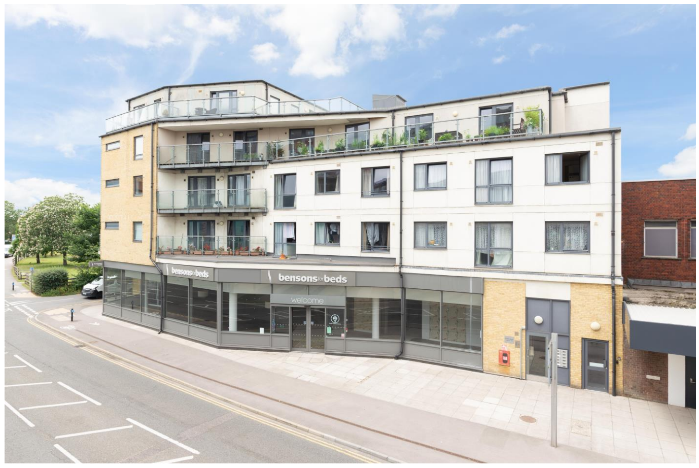
Flat 14 Colwell House Hepworth Way Walton-On-Thames Surrey KT12 1DP £1350pcm + Initial deposit